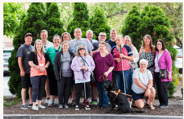
Group photo from the adult clinic in June