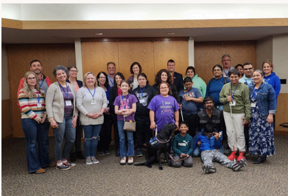
Group photo from the pediatric clinic in March