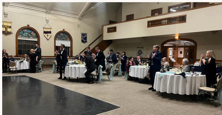
Attendees standing and clapping at the Gala

We had so many great donated Silent Auction items at our Gala by various individuals and companies. Thank you to everyone who donated towards our Gala and towards our Silent Auction!