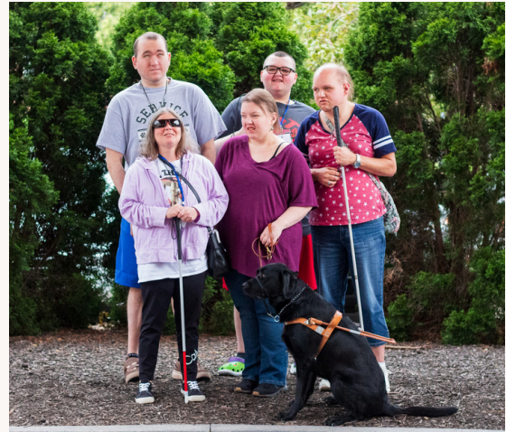
The whole group of Alström attendees for the Clinic in June

A key goal of these clinics is to improve the quality of life for individuals with Alström Syndrome, emphasizing empowerment and ongoing support throughout their unique health journeys. The success of these gatherings promises continued progress and hope for the future.