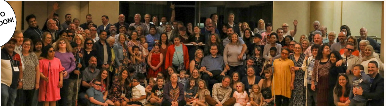
The whole group from the ASI Family Conference in Baltimore in 2023