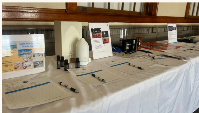
Silent Auction tables at the Gala